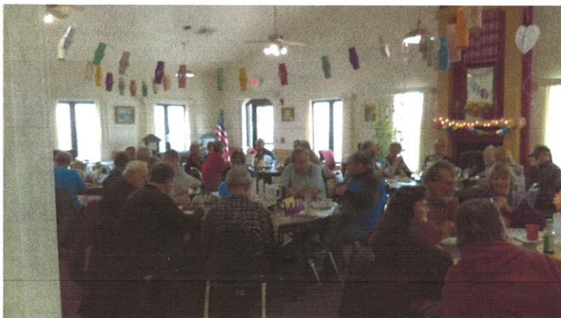
Lunch at the Carlin Senior Center – May 2017

This institution is an equal opportunity provider and employer.